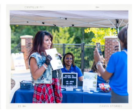
stand out among competitors as a business that invests in our community