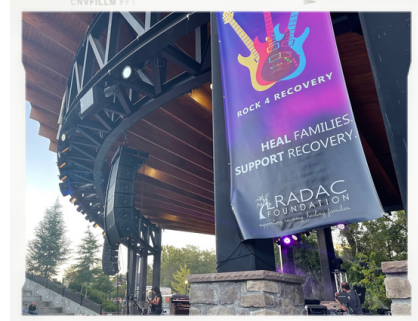
return on investment with donation to 501c3