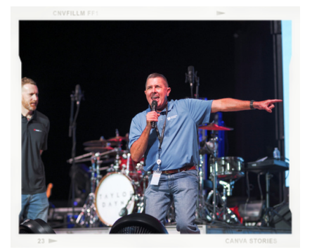
brand visibility provides generation of leads